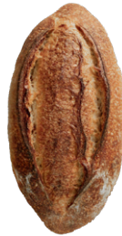
FRENCH SOURDOUGH Weight: 20 oz.