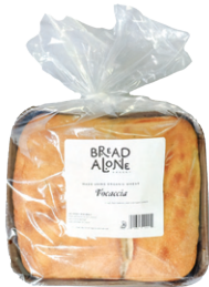
FOCACCIA Weight: 14 oz UPC: 40345000211