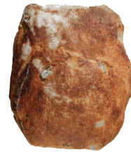
OLIVE CIABATTA Weight: 16 oz.