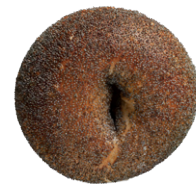
POPPYSEED BAGEL Weight: 4.5 oz