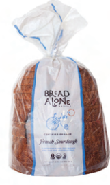
FRENCH SOURDOUGH Weight: 22 oz UPC: 40345000655