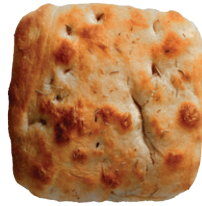
FOCACCIA Weight: 14 oz.