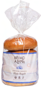
PLAIN BAGEL Weight: 18 oz UPC: 40345001324