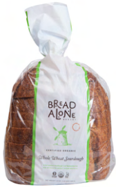
WHOLE WHEAT SOURDOUGH Weight: 22 oz UPC: 40345000051