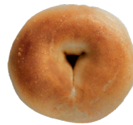
PLAIN BAGEL Weight: 4.5 oz