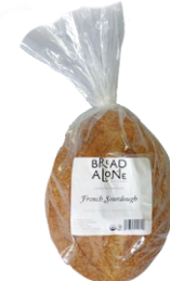
FRENCH SOURDOUGH Weight: 20 oz UPC: 40345000792