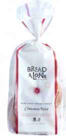
CINNAMON TWIST Weight: 16 oz UPC: 40345002796