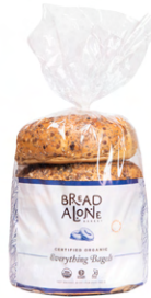
EVERYTHING BAGEL Weight: 18 oz UPC: 40345001355