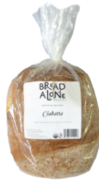
CIABATTA Weight: 16 oz UPC: 40345000426