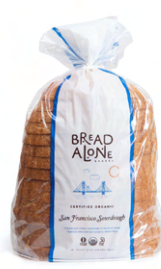
SAN FRANCISCO SOURDOUGH Weight: 22 oz UPC: 40345001256