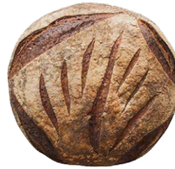
WHOLE WHEAT SOURDOUGH BOULE Weight: 64 oz.