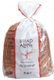
RYE SOURDOUGH Weight: 22 oz UPC: 40345000044