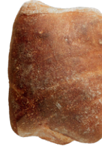
CIABATTA Weight: 16 oz.