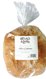
OLIVE CIABATTA Weight: 16 oz UPC: 40345001911