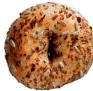
EVERYTHING BAGEL Weight: 4.5 oz