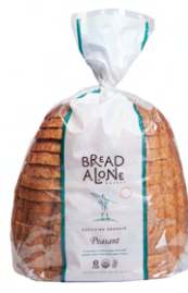
PEASANT Weight: 20 oz UPC: 40345000013